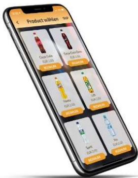
Direct product selection