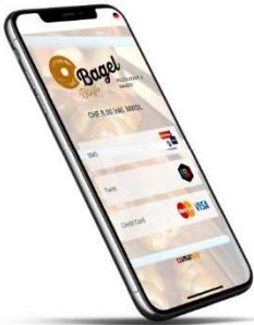
Web-based payment page